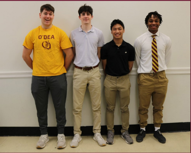
L-R: Spirit Fri'Dea, Regular Dress Code, Regular Dress Code, Mass Attire