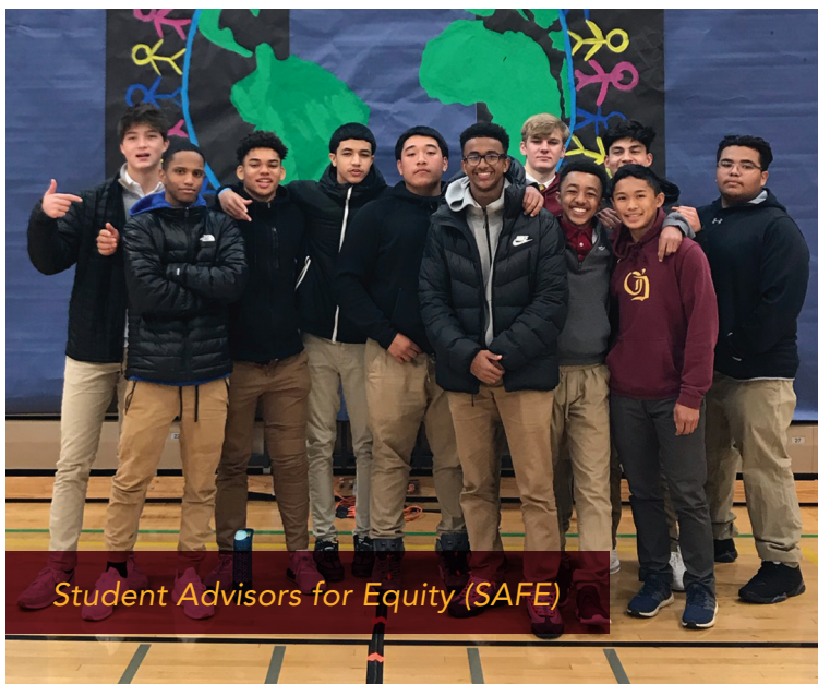
Student Advisors for Equity (SAFE)